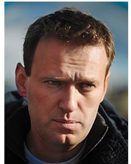
(Right: Alexei Navalny in 2011)

Holy Week is a good time to be reminded of the cost of standing up for what we believe to be right, in whatever way we can. That even when our efforts for justice and righteousness appear futile, we're still contributing to building a community that demands a better way and a more godly kingdom.