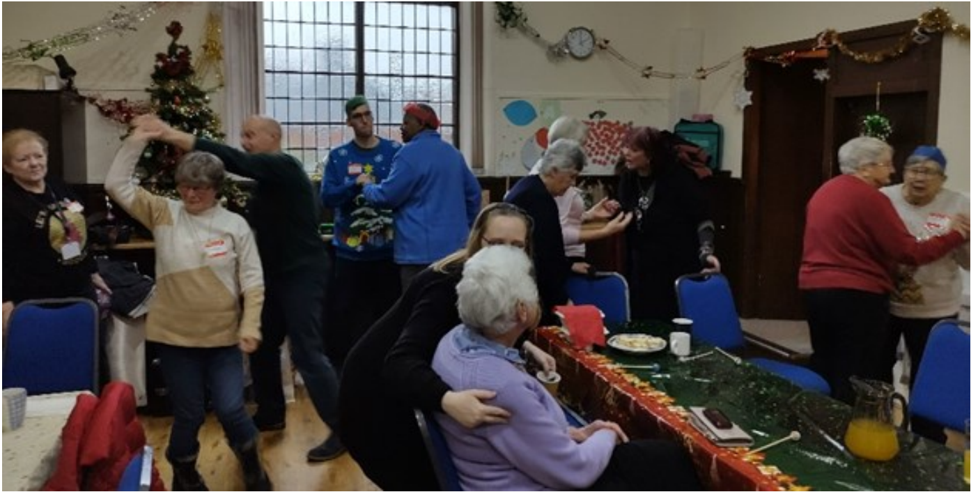
Above: 8th December— the RVS, who come every Friday and work with our own volunteers to provide lunch and games, hosted a special Christmas lunch for our own volunteers and guests. Afterwards— dancing broke out!