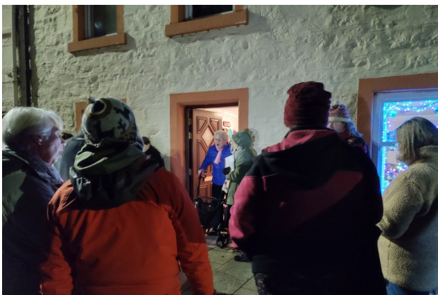
Right and below right: Photos show us carol singing on the High Street, featuring Little Donkey outside Heather Vets