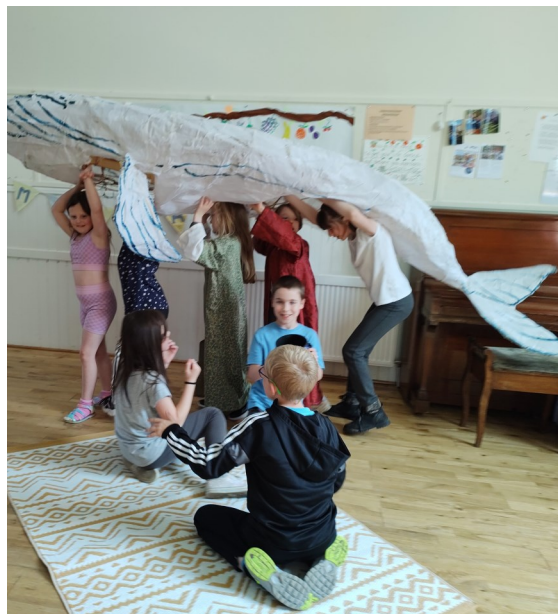
The photo (above) shows children getting up close and personal with the whale, and the story about Jonah.